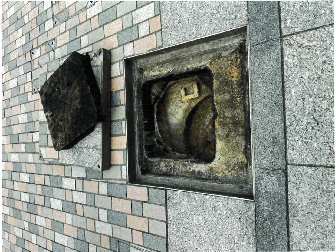
SM02 [Photo taking at 18/02/2025]