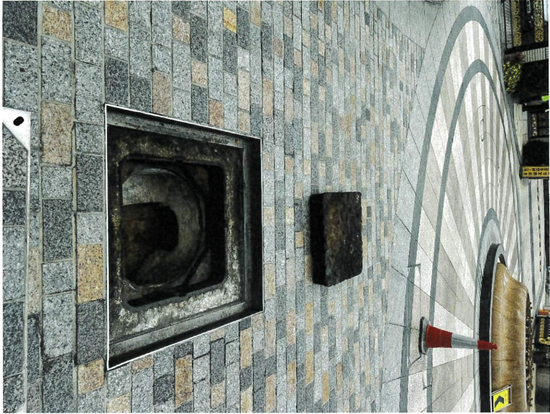
SM03 [Photo taking at 18/02/2025]