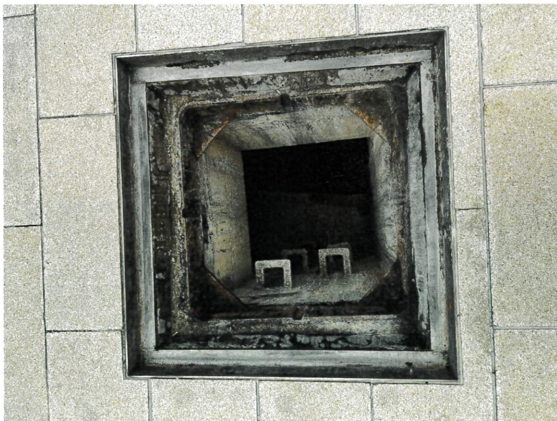
SM04 (Internal) [Photo taking at 18/02/2025]