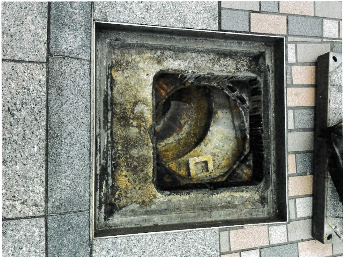
SM02 (Internal) [Photo taking at 18/02/2025]