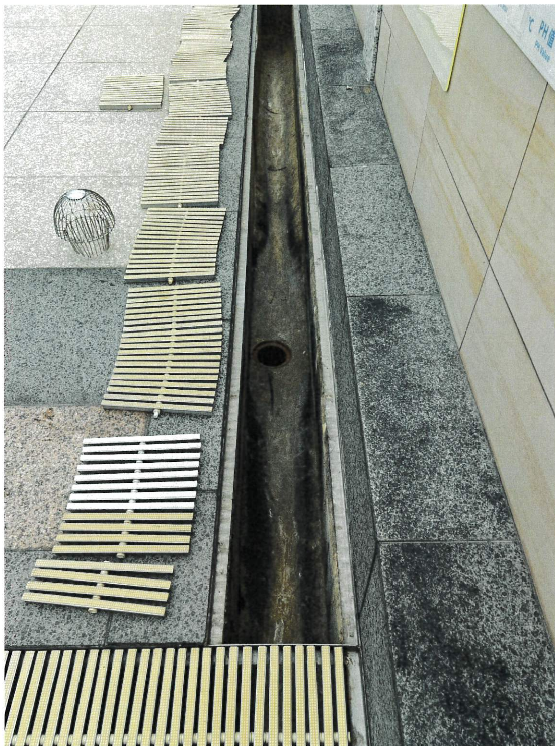
Swimming Pool U-Channel (View 1)