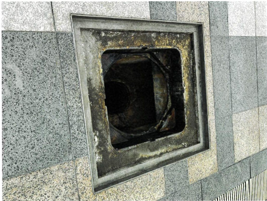
SM01 (Internal) [Photo taking at 18/02/2025]