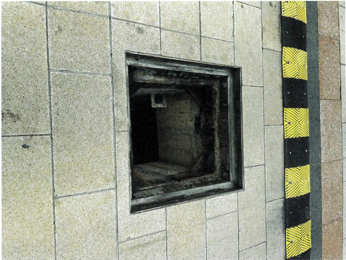
SM04 [Photo taking at 18/02/2025]