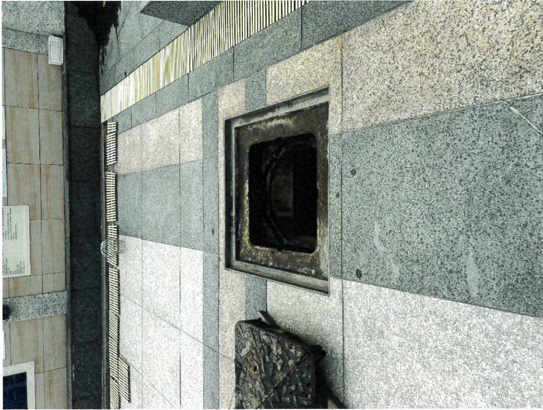
SM01 [Photo taking at 18/02/2025]